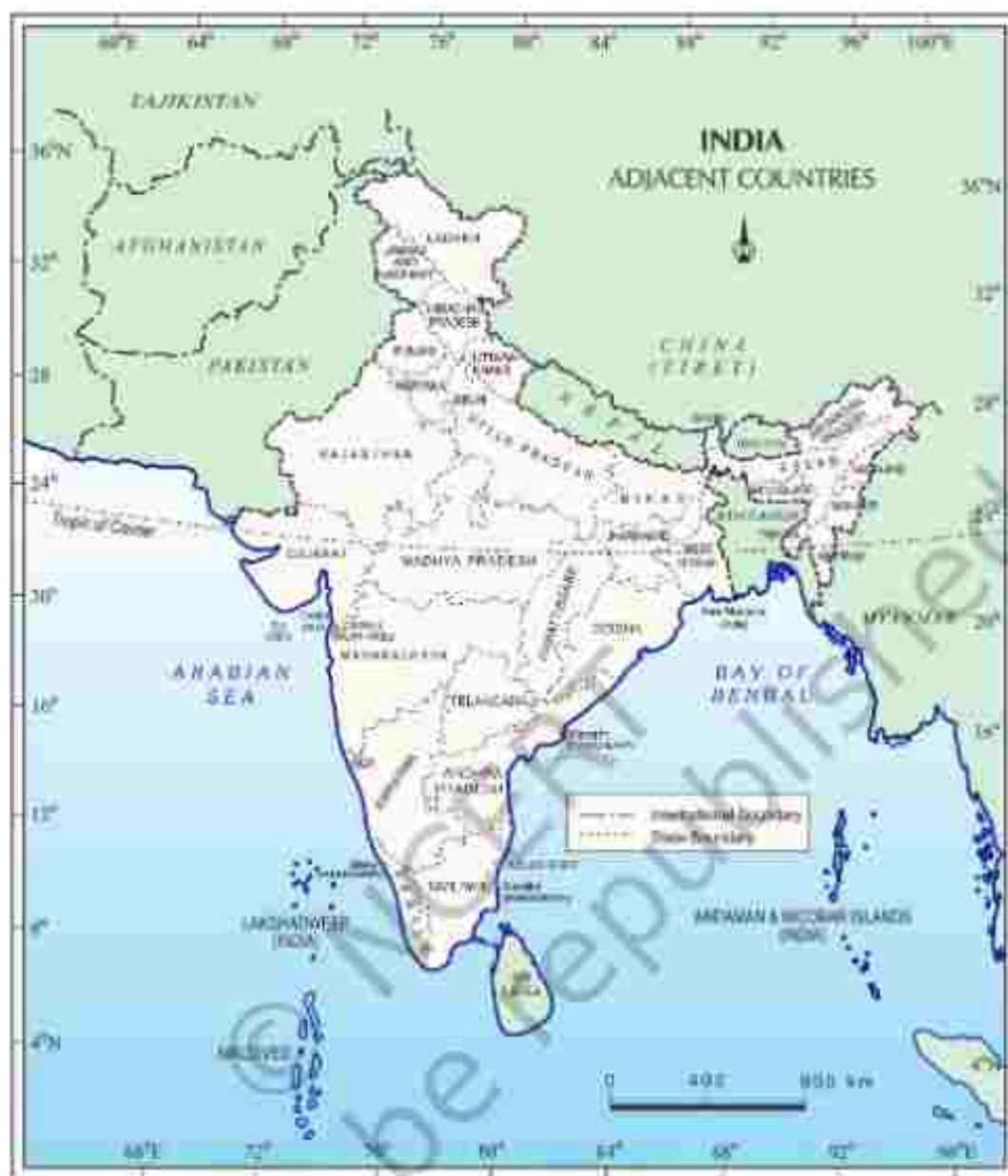
Figure 1.5 : India and Adjacent Countries

Sri Lanka and Maldives. Sri Lanka is separated from India by a narrow channel of sea formed by the Palk Strait and the Gulf of Mannar, while Maldives Islands are situated to the south of the Lakshadweep Islands.