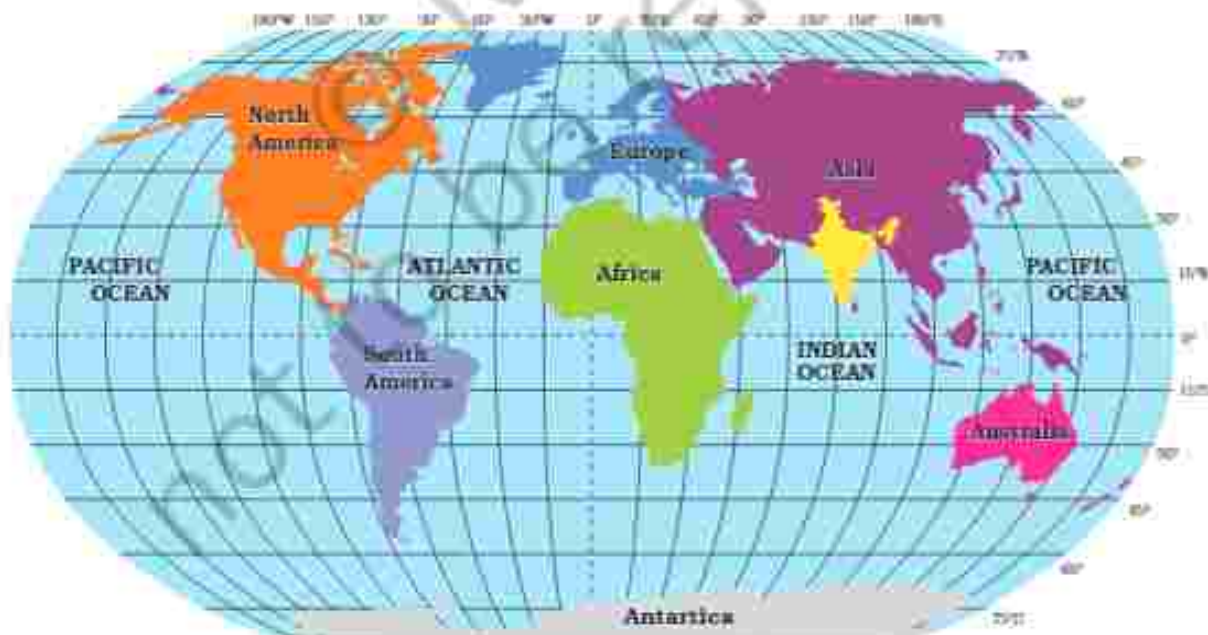
Figure 1.1 : India in the World

The land mass of India has an area of 3.28 million square km. India's total area accounts for about 2.4 per cent of the total geographical